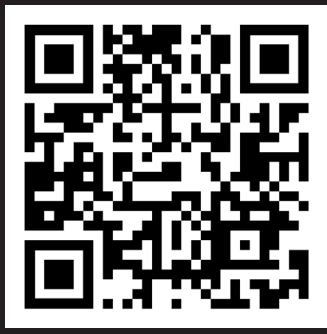
Buffalo State Theater